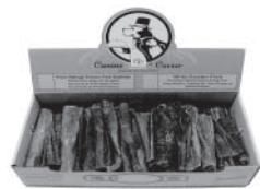
Buffalo Green Tripe Flat