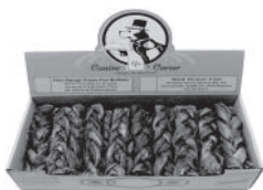
Buffalo Stix Braided