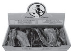
Buffalo Jerky Flat