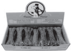
Compressed Tripe Buffalo Bone